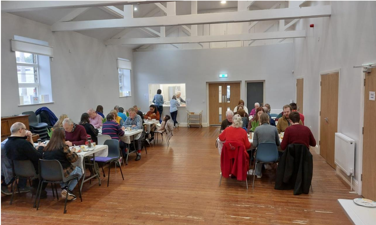
Easter Breakfast 2024 in the Community Hall

Our church is well placed at the midpoint of the length of Beacon Road. The church, and now more so the Community Hall, is becoming readily accepted as the hub of the community. We purposely get involved in local activities, social nights, Councillor sessions and other forums or activities to promote community cohesion.